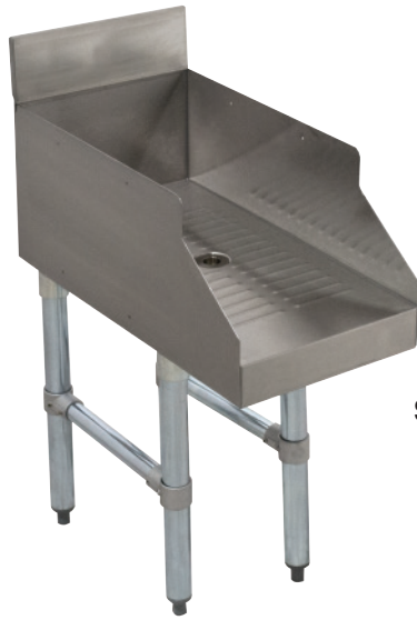
SL-GS Series 23" Wide Units