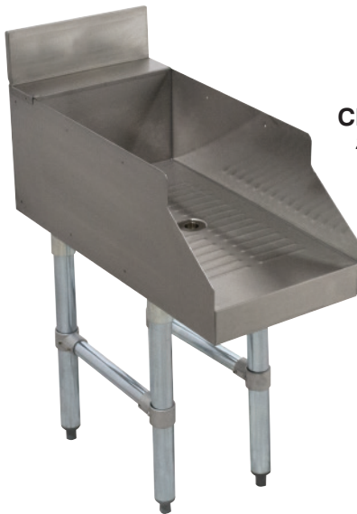
CR-GS Series 26" Wide Units