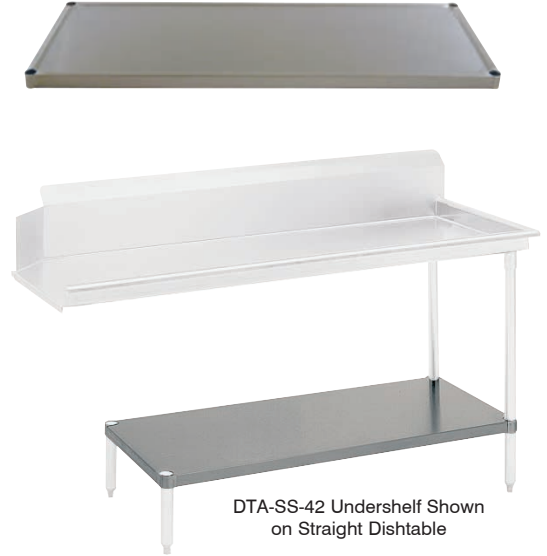
DTA-SS-42 Undershell Shown on Straight Dishtable