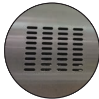
Vented Side Panels