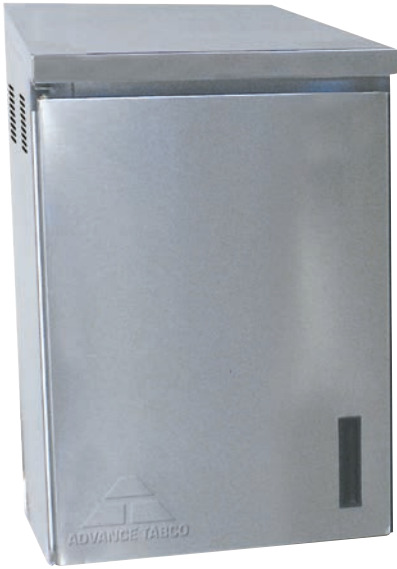
WCH-15-24 Left Hinged Shown (Standard)*