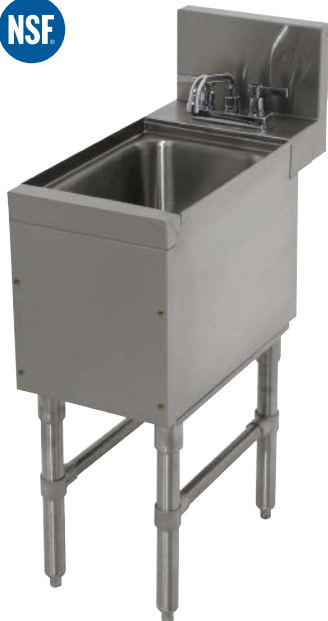
PRHS-24 Series 25" Wide Units With Deck Mount Faucets