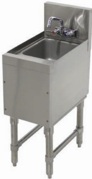
PRHS-19 Series 20" Wide Units With Splash Mount Faucets