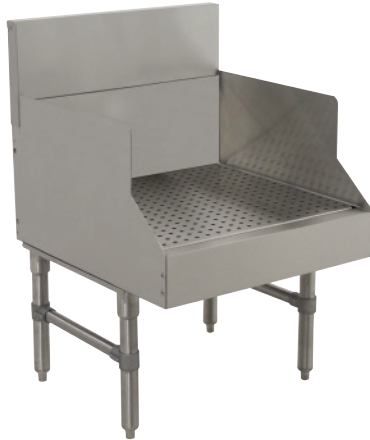
PRGS-19 Series 25" Wide Units