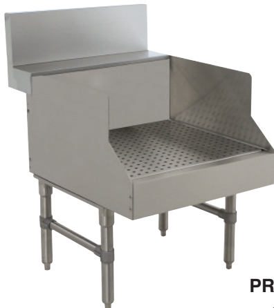
PRGS-24 Series 30" Wide Units