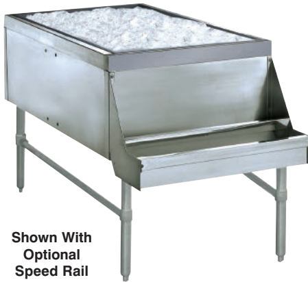
Shown With Optional Speed Rail