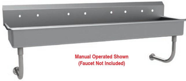
Manual Operated Shown (Faucet Not Included)