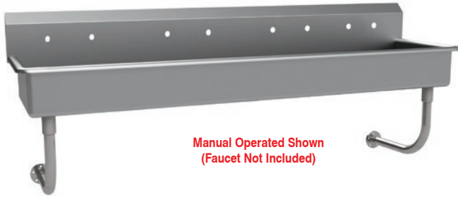
Manual Operated Shown (Faucet Not Included)