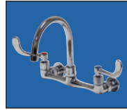
"-F" Series Sink Includes K-161-LU Gooseneck Faucets with Wrist Handles