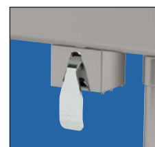
Knee Valves Included