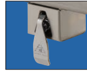
Knee Valves Included On All "KV" Models