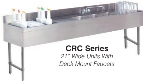
CRC Series 21" Wide Units With Deck Mount Faucets