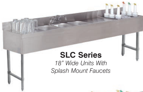
SLC Series 18" Wide Units With Splash Mount Faucets