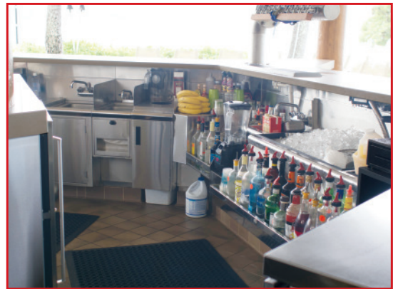
Shown with PRF-2045ICM Custom Filler & PRLR-18 Liquor Rack